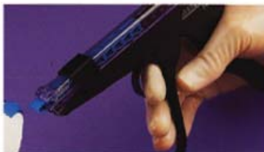
4. Release the trigger and the clip closes. The next clip slides into position ready to apply.